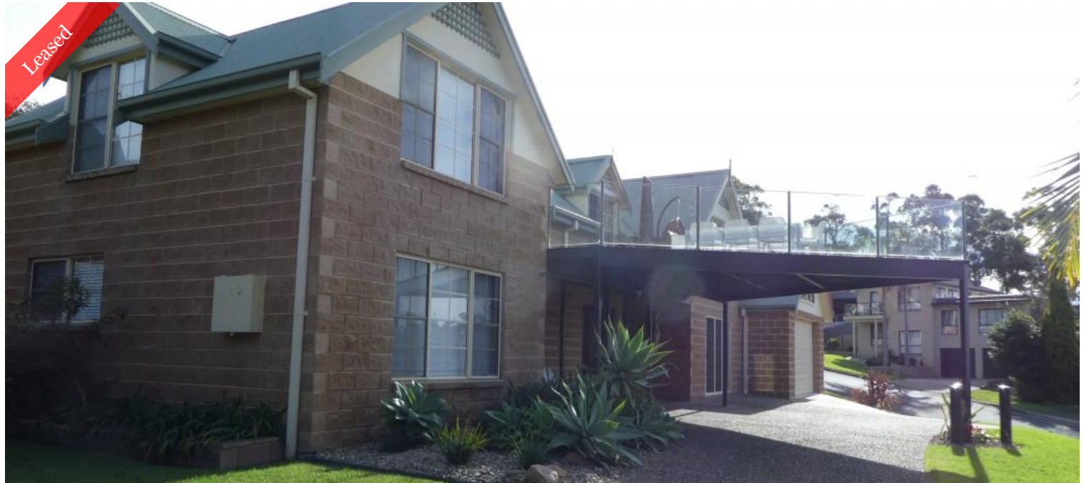
109 Tura Beach Dr, Tura Beach