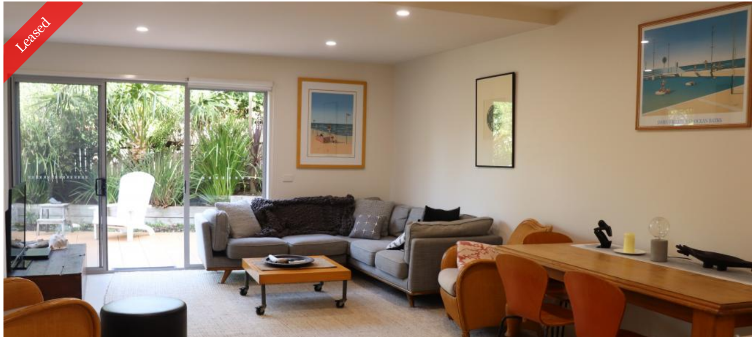
Unit 10, 79-81 Culgoa Cres, Pambula Beach