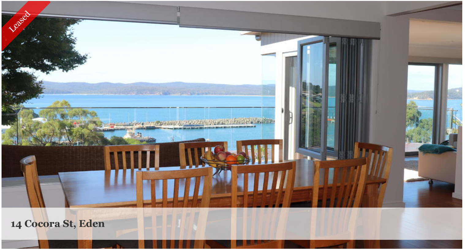
14 Cocora St, Eden